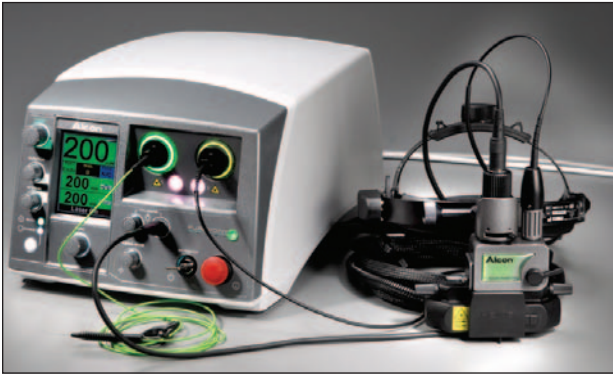
Figure 2. Endoprobe and LIO plugged into the console.